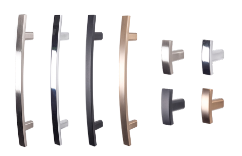
Satin Nickel, Chrome, Matte Black, Rose Gold 6", 7-1/8"; 1-7/16" Knob