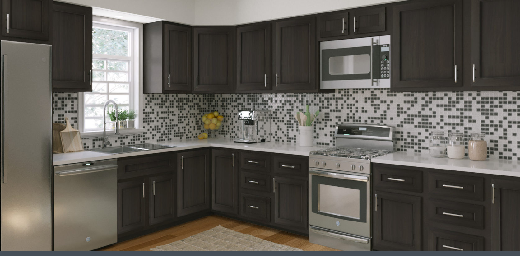
Shaker Classic Espresso

We provide quick delivery and huge savings compared to full cabinet replacement. Our kit and video instructions are all you need to easily rejuvenate your kitchen and bath.