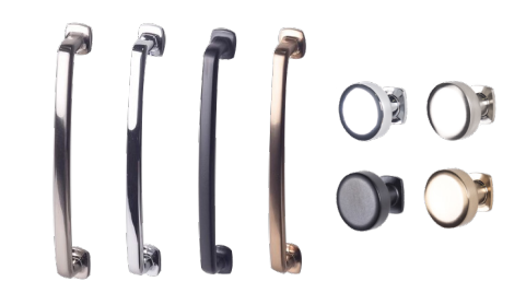
Cottage Satin Nickel, Chrome, Matte Black, Rose Gold 4-1/2", 5-7/8"; 1-7/32" Knob