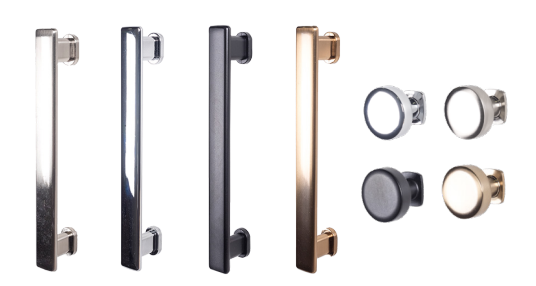
Artisan Satin Nickel, Chrome, Matte Black, Rose Gold 4-3/4", 6-1/16"; 1-7/32" Knob