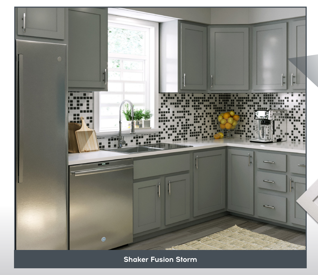
FUSION: Slab drawer fronts in combination with 5-piece door fronts.