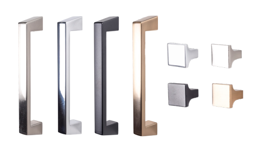
Loft Satin Nickel, Chrome, Matte Black, Rose Gold 4-5/8", 5-7/8"; 15/16" Knob