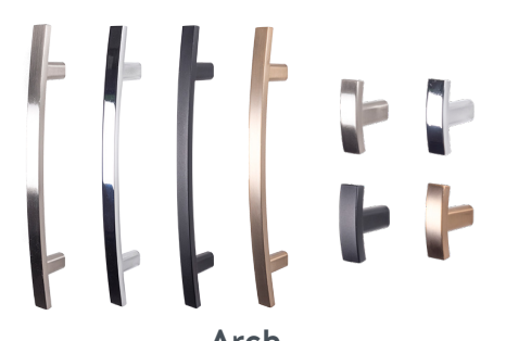
Satin Nickel, Chrome, Matte Black, Rose Gold 6", 7-1/8"; 1-7/16" Knob