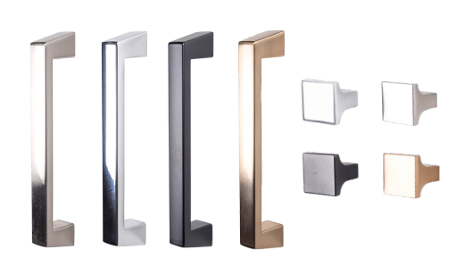
Satin Nickel, Chrome, Matte Black, Rose Gold 4-5/8", 5-7/8"; 15/16" Knob