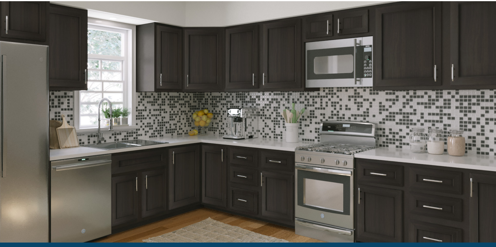
Shaker Classic Espresso

We provide quick delivery and huge savings compared to full cabinet replacement. Our kit and video instructions are all you need to easily rejuvenate your kitchen and bath.