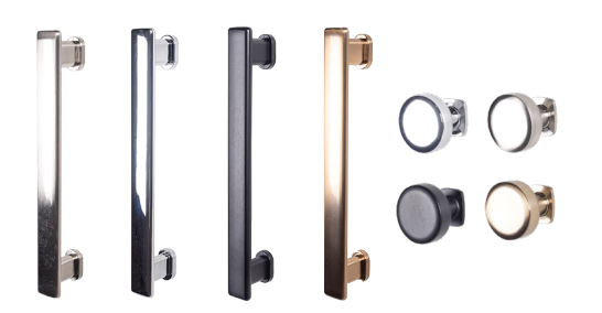
Artisan Satin Nickel, Chrome, Matte Black, Rose Gold 4-3/4", 6-1/16"; 1-7/32" Knob