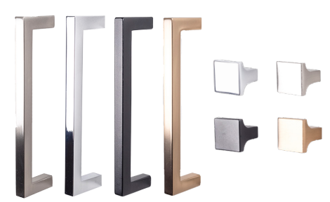
Square Satin Nickel, Chrome, Matte Black, Rose Gold 4-1/4", 5-7/16"; 15/16" Knob