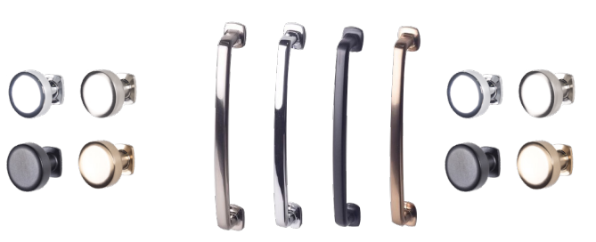
Cottage Satin Nickel, Chrome, Matte Black, Rose Gold 4-1/2", 5-7/8"; 1-7/32" Knob